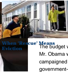
When 'Rescue' Means Eviction