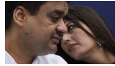
Love Story Turns Into Political Drama