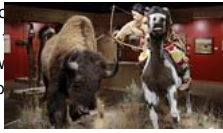
A Home Where the Buffalo