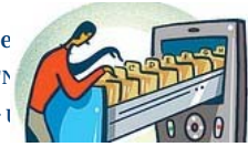
Lost Cellphone? Carriers Have Backup